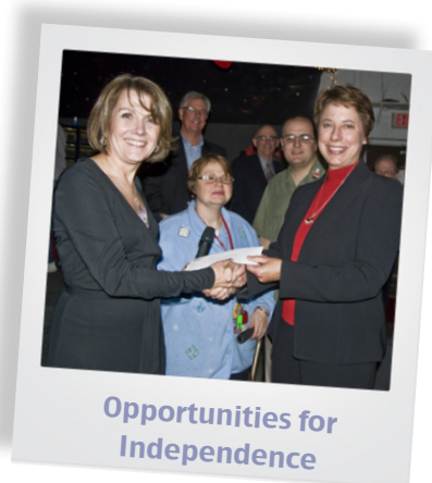
Opportunities for Independence