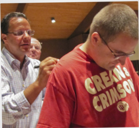
Empowerment by Experience